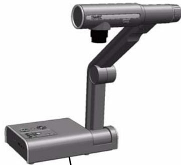
Serial Number Location

To make sure that you have the correct service parts diagrams, you must verify the serial number of your SDC-330. The serial number is located on the bottom of the camera base. An example of the serial number format is shown below.